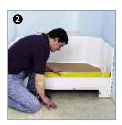
Locate, level and fix the base.