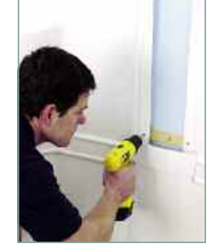
Slot the side panels to the base and fix to the back wall batons, using the spacer provided to ensure that the correct gap is left for the back panel.