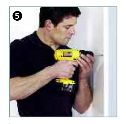
The front edges of the side panels can then be secured to the side wall batons and the fixing screws will be concealed by the door frame.