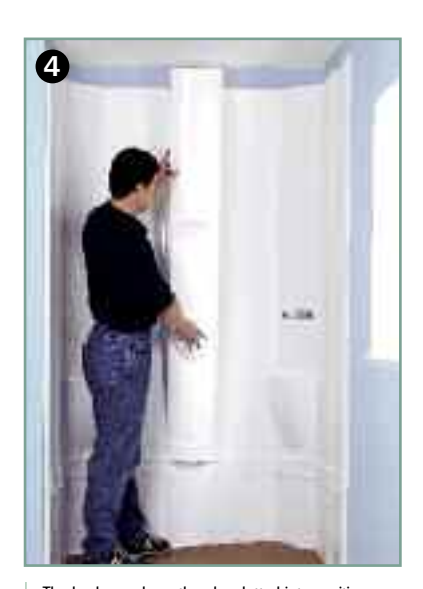
The back panel can then be slotted into position and secured with a single screw.