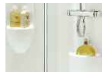
The built-in shelves provide convienient, easy clean surfaces for shampoo and shower gels.