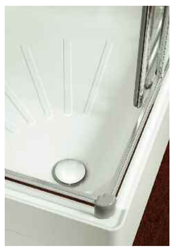
Shower bases are totally rigid and feature a unique patent protected 'Waterguard' - an angled lip around the outer edge of the walls and showertray, which provides extra watertight protection.