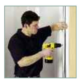
When fitting the shower door position the wall channels and drill the screw holes.

Coram's shower doors have been designed to be faster and easier to fit than any other on the market, which is why Coram has become a leading provider of shower enclosures to trade installers. Each shower door is supplied fully assembled, so that on site all that is required is to fit the handle and then install it using the wall channels as shown below.