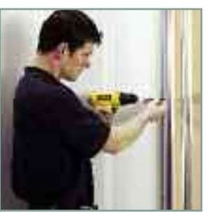
The door is finally secured by drilling through the wall channels into the door frame and fixing with screws.