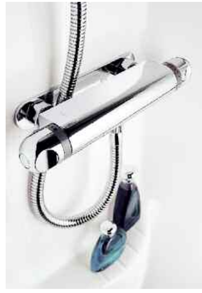
Shower pods come complete with a choice of high performance thermostatic mixer showe

Many shower enclosures manufactured abroad are prone to leaks, but this is not a problem because continental bathrooms are usually fully tiled with solid concrete floors. In Britain however, where we have wooden floors and carpeted bathrooms, leaks can cause serious damage. For a guaranteed watertight shower enclosure, fit Coram — designed and built in Britain to suit British site requirements.