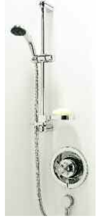
Thermostatic built-in concentric mixer shower