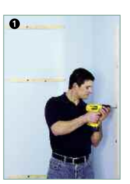
Position and fit the fixing batons to the wall.