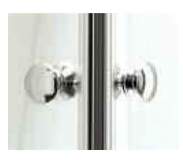
Shower doors feature high quality, all metal chrome handles

Shower pods can be fitted either in an alcove or a corner. For alcoves we offer three sizes and for corners you have the choice of the Corner Pod on the left or the stylish Quadrant Pod shown on page 2. Each pod comes complete with a beautifully finished, high quality shower door that opens both smoothly and silently.