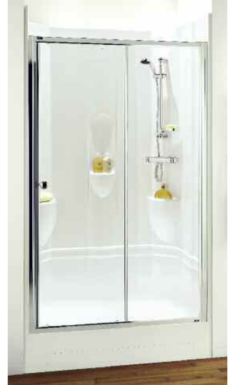
Alcove Pod 1200 x 800mm with Sliding Door